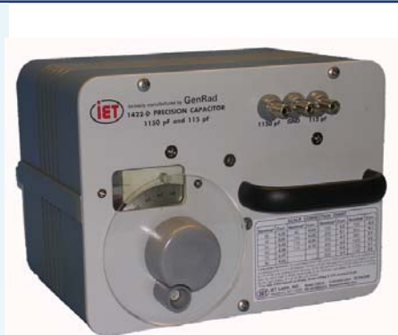
Model 1422-D Precision Capacitor