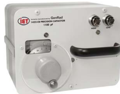
Model 1422-CB/CL Precision Capacitor