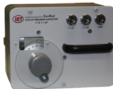
Model 1422-CD Precision Capacitor