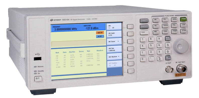
Figure 1. N9310A front view (default configuration, without handle and bumper)