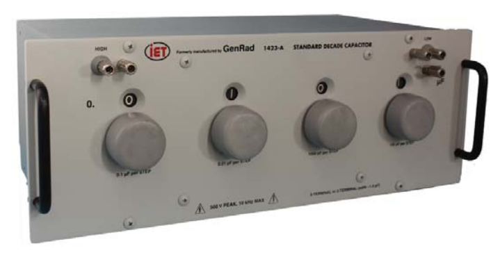
1423-A Decade Capacitor

Any value of capacitance from 100\,\mathrm{pF} to 1.111\,\mathrm{\mu F} in steps of 100\,\mathrm{pF} , can be set on the four decades and will be known to an accuracy of \pm 0.05\% , see specifications. The terminal capacitance values are set precisely to the nominal value and can be readjusted later at calibration intervals, if necessary, without disturbance of the main capacitors. The 1423 consists of four decades of high-quality silvered-