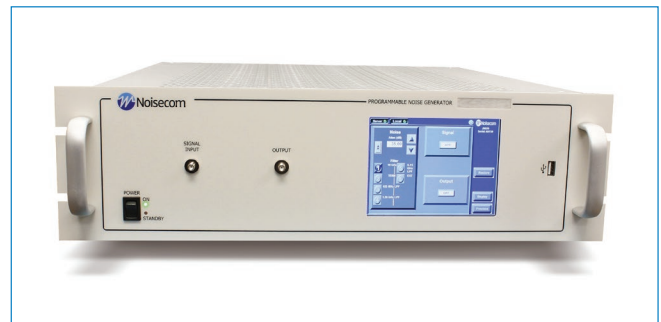
3U High - U7opt18

Wireless Telecom Group Inc. 25 Eastmans Rd Parsippany, NJ United States Tel: +1 973 386 9696 Fax: +1 973 386 9191 www.noisecom.com