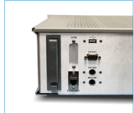
Removable drive - U7opt17